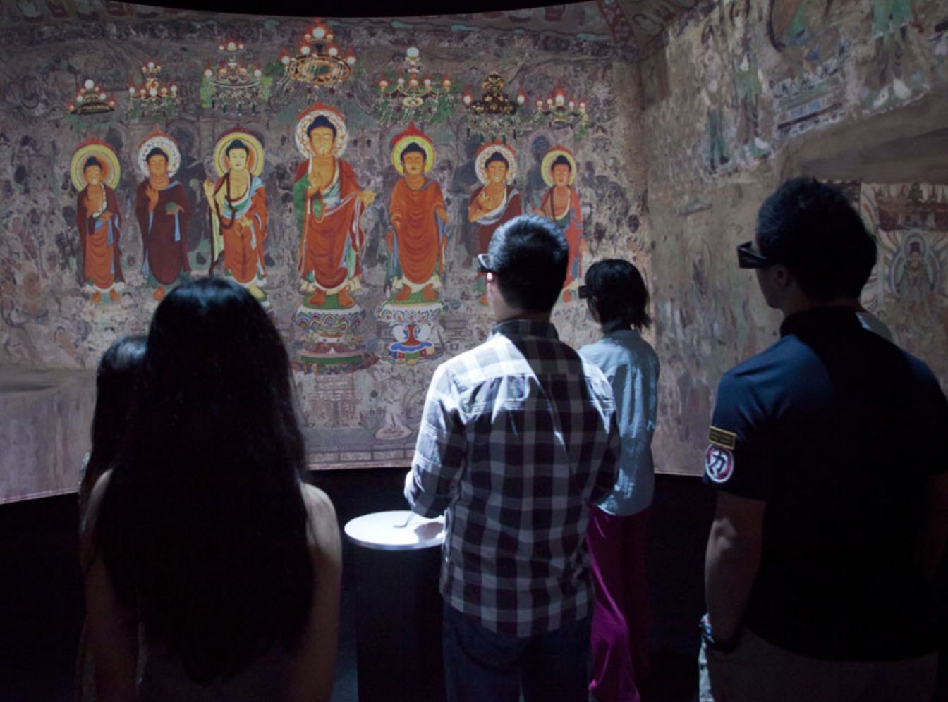
Photo 5. Viewing vividly re-colored Medicine Buddhas in Pure Land: Inside the Mogao Grottoes at Dunhuang .

detach itself from the plane of the painting and float closer and closer to the viewer. In effect, what is being simulated is the real-world dynamic of a viewer approaching closer to the mural to examine it in more detail—but in Pure Land this greater detail enlarges and approaches the stationary viewer, a digital trompe l'oeil effect that has a powerful perceptual impact.