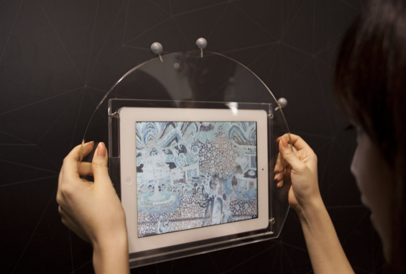
Photo 11. When the tablet is held against the wall, the murals appear at one-to-one scale. Pure Land: Augmented Reality Edition, Shanghai Biennale 2012-2013.

perceived in 3D within the larger circumference of the circular projection screen. These are complementary yet different approaches to the challenge of digitally reconstituting the space of the actual cave, at scale.