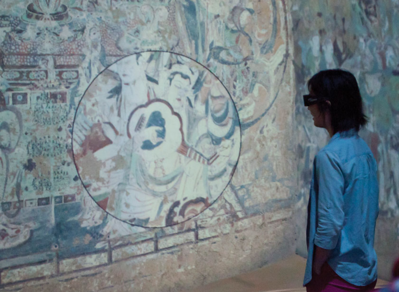
Photo 4. A visitor uses the magnifying glass to inspect a musician in the mural at Pure Land: Inside the Mogao Grottoes at Dunhuang .

its wall paintings and sculptures. This initial immersion in the virtual cave is meant to simulate what the viewers' rather limited experience would be if they were visiting the real Cave 220.