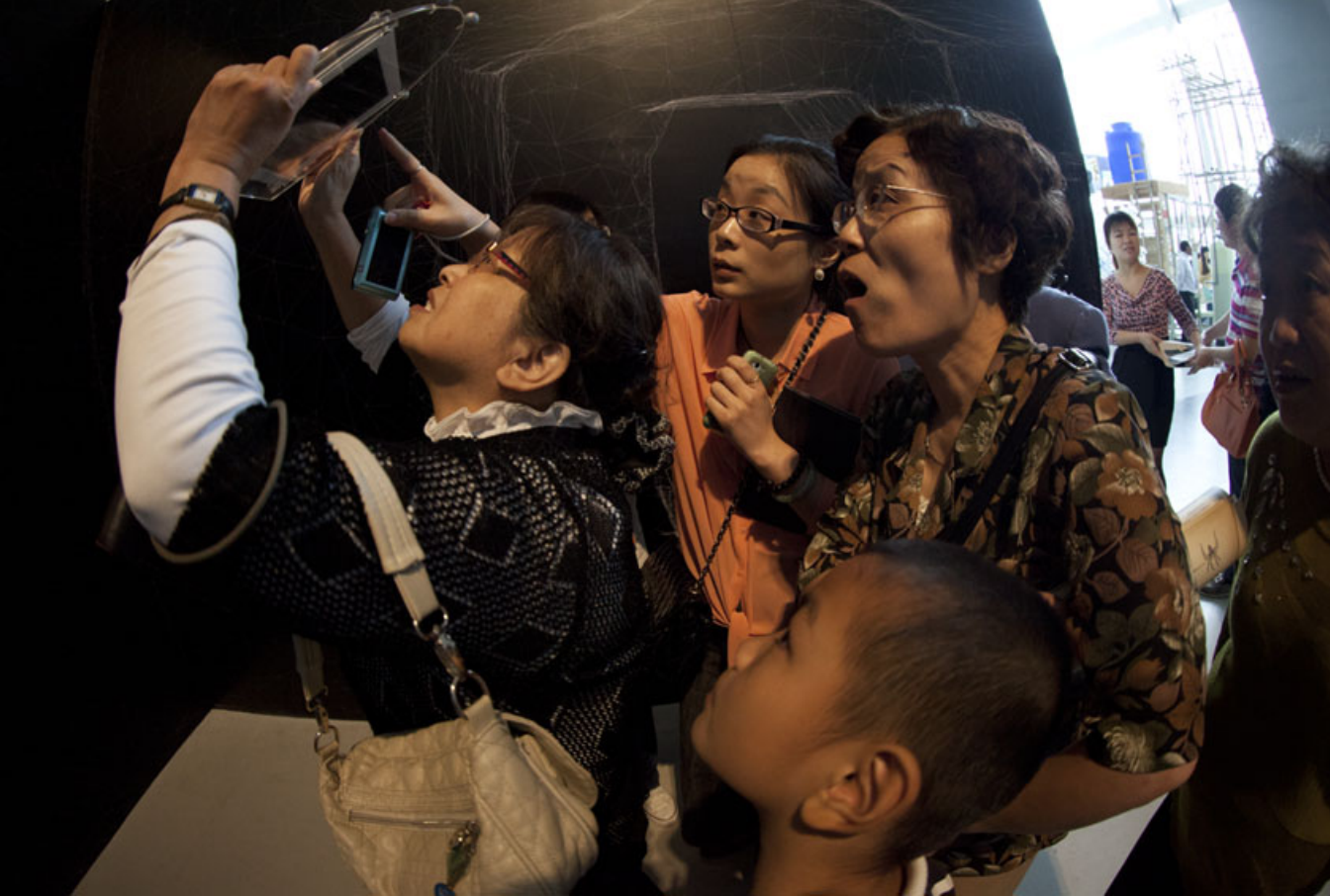
Photo 12. Astonished visitors explore the digital Cave 220 in a multi-user social experience. Shanghai Biennale 2012-2013.