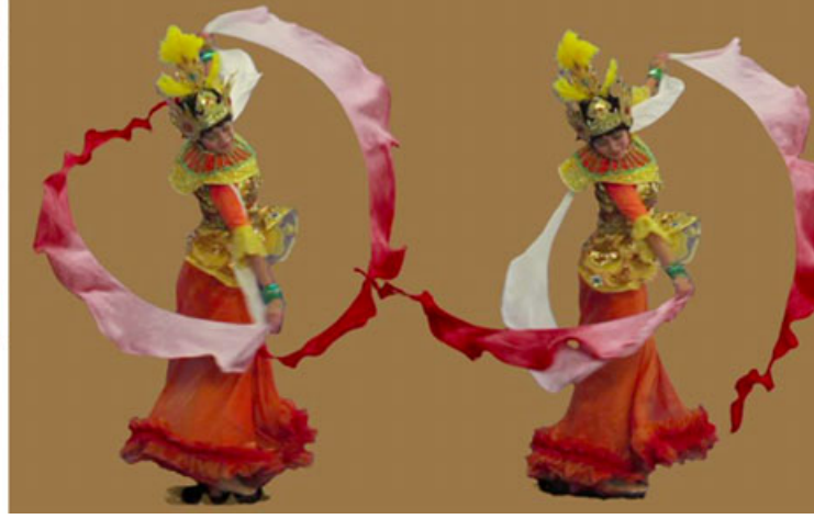
Photo 7. Filming in a blue screen studio, dancers are added to the imagery.

images have always been subject to media technologies of spatial illusion, immersion, and display, and “every epoch uses whatever means available to create maximum illusion” (Grau 2003, 5). Museum visitors gaze through lenses that have been refined over many centuries. Finding “presence” (or literally “being there”) in today’s virtual environments 25 is the result of traversing the histories of technologic immersion—generations of ‘oramas, sensoriums, and all manner of optical devices. It is to delight in automata, to believe in magic and the phantasmagoric, and to be transported by special effects.