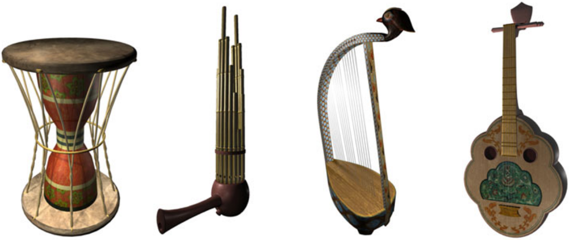
Photo 6. Examples of the 3D reconstructed instruments (left to right: yagou, sheng, konghou, and ruan) in Pure Land: Inside the Mogao Grottoes at Dunhuang .

painting. Two performers from the Beijing Dance Academy were filmed in 3D and inserted (“composited”) into the mural scene (photo 7), giving the painting yet another dimension of “aliveness.”