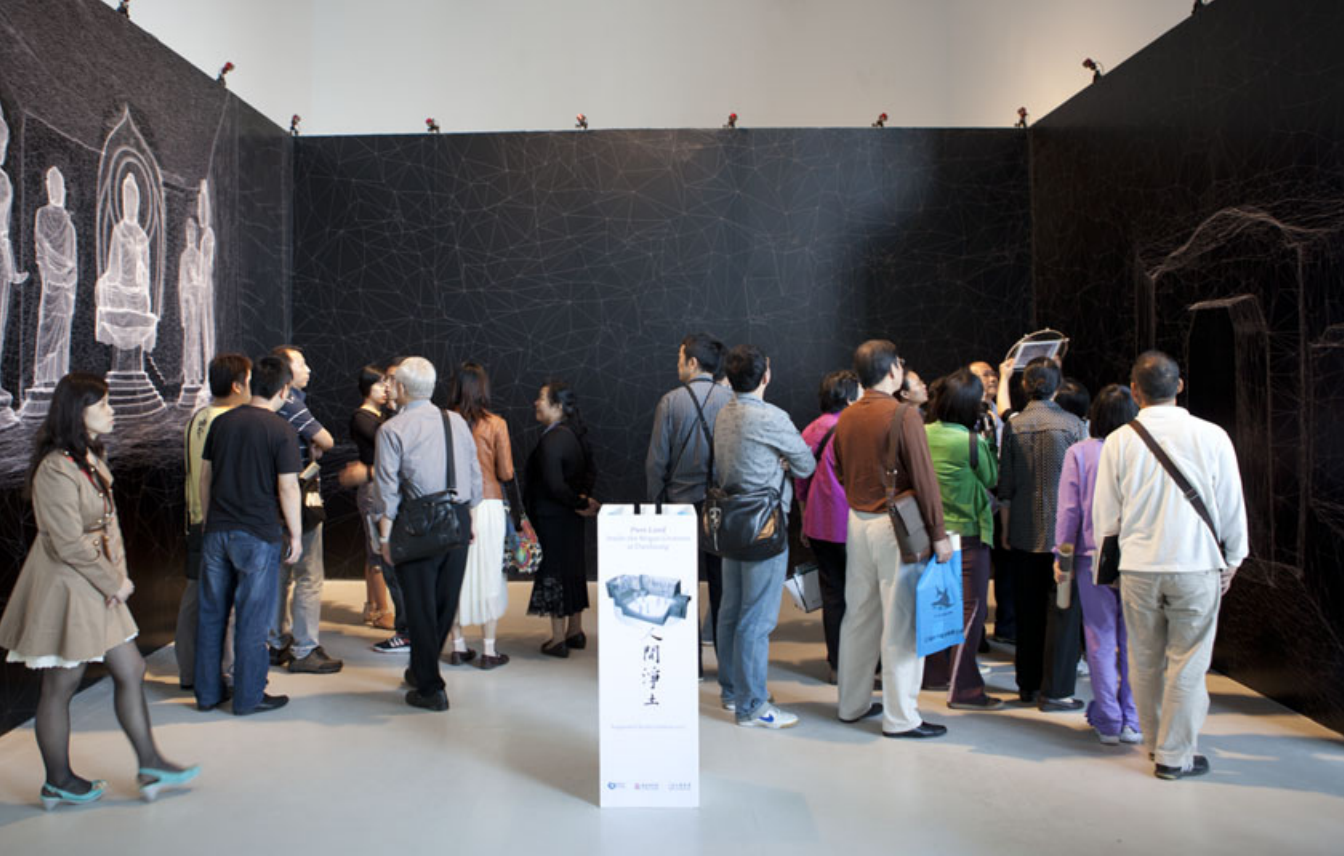
Photo 1. Pure Land: Augmented Reality Edition, installation at the Shanghai Biennale 2012-2013.

commonplace big screen documentary into kinesthetic and phenomenological encounters with the places they depict. 4