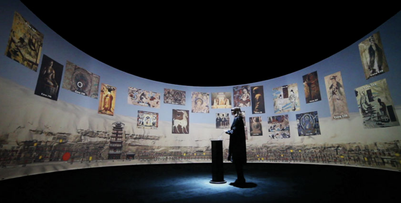
Photo 3. Installed at the beginning of Pure Land: Inside the Mogao Grottoes at Dunhuang , a browser displays significant caves distributed along the escarpment.

advanced digital imaging techniques for conservation and preservation needs, 20 but they have also become necessary tools integrated into cultural memory and vital to living communities of practice. As we have seen, the Dunhuang Academy is at the forefront of this research, not only because the site demands it, but also because of its importance in the cultural memory and imagination of Chinese.