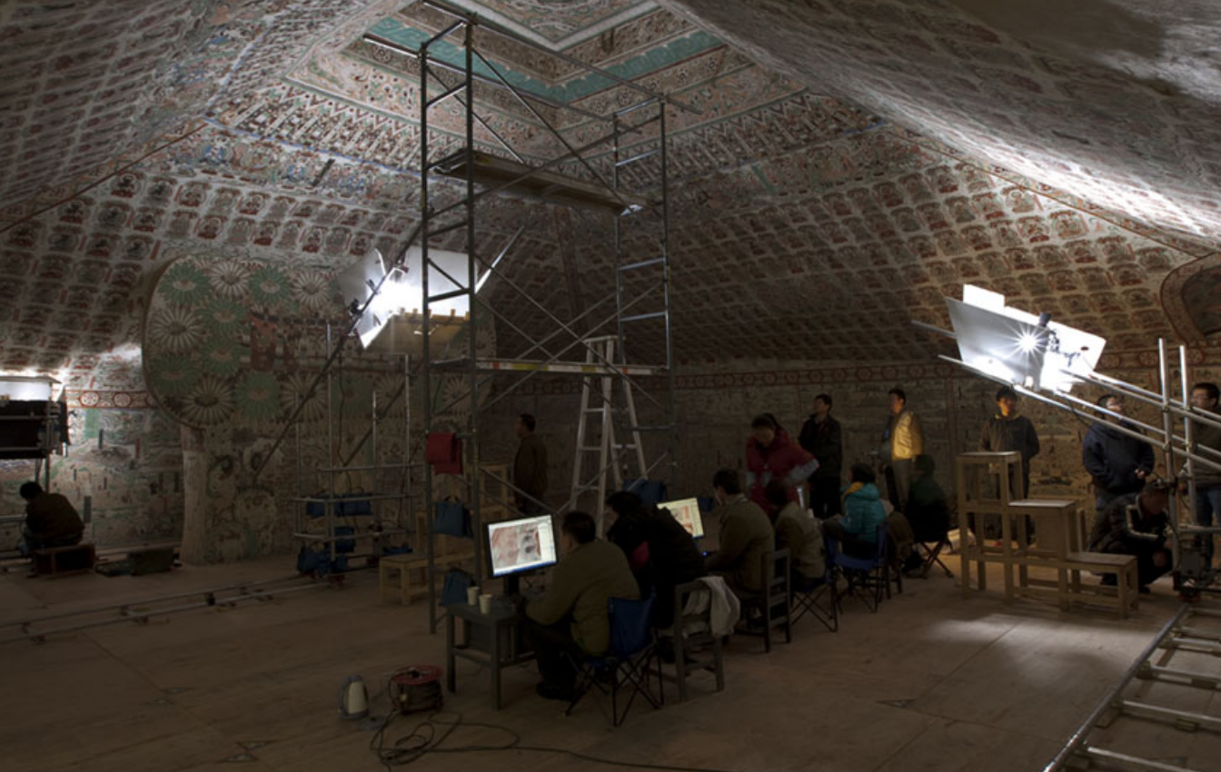
Photo 2. Digitization station at Cave 61.

to the world, and the ongoing protection of the caves. A New York Times journalist who visited the site wrote: